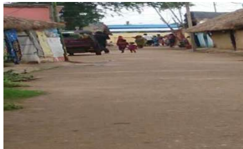
Road condition before