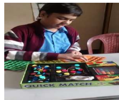
Specific skill development sessions to foster better eye hand coordination, cognitive skills, social interaction and reciprocity.