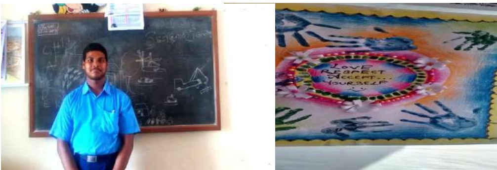
Use of Art and Colours as an intervention technique, to share feelings, emotions, thoughts and experiences

Championing child rights, internalization and practice has been the mission of OLS. The Counselling Unit serves as the mainstay of imparting psychological guidance, counselling sessions and interventions based on the backbone of child rights and ensuring the best interest of the child.